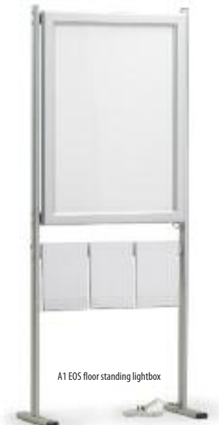
A1 EOS floor standing lightbox