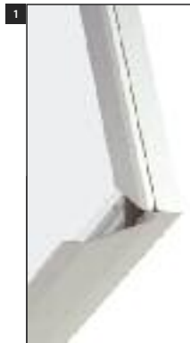
1. Open frame