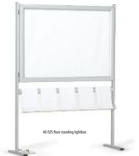
A0 EOS floor standing lightbox