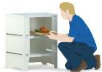
Two handy internal storage shelves