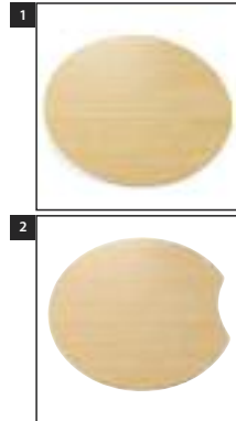
1. Circular top 2. Crescent top